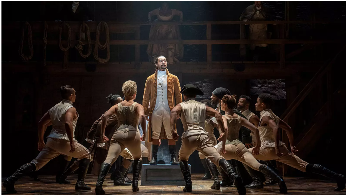
Hamilton National Tour.